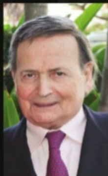
BYRON JANIS Legendary Pianist

PALM BEACH SYMPHONY Gala & Concert: Redefining the Romantics