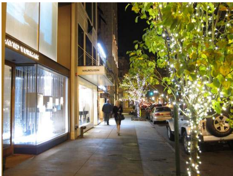
Looking north along Madison Avenue from 63rd Street. 9:00 PM.