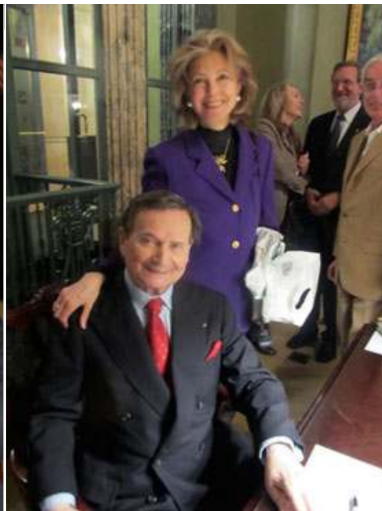
Byron and Maria Cooper Janis.